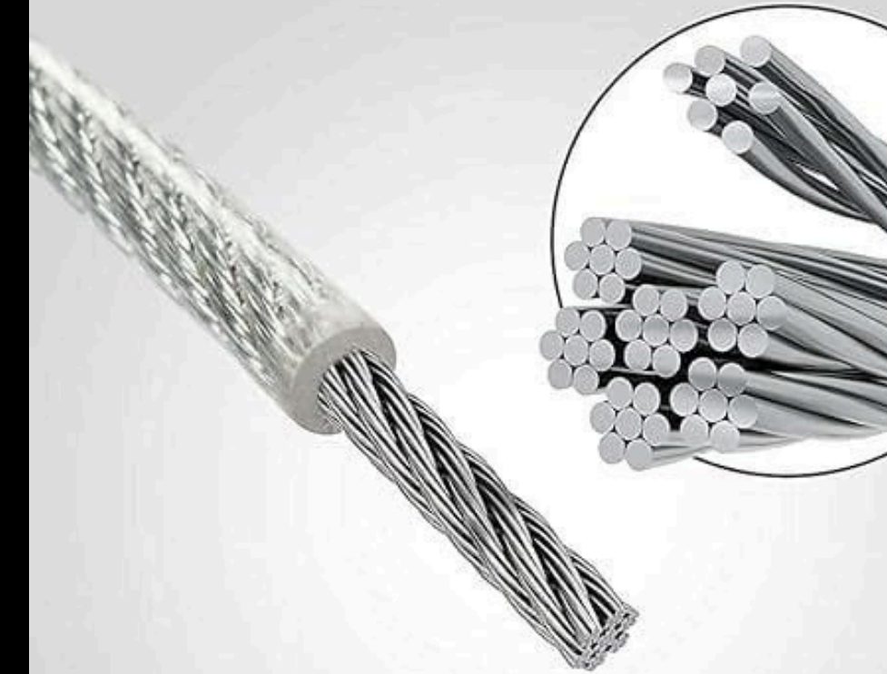
7x7, NON-FRAYING ROPE